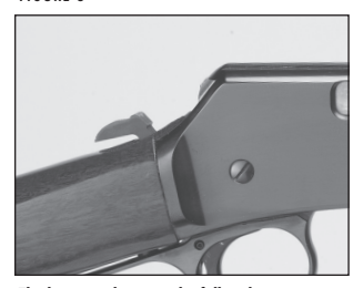
The hammer shown in the full-cock position.

when the rifle is cocked and ready-to-fire or when the hammer is in its dropped position. The hammer has three positions: Full-cock, half-cock, and dropped or fired.