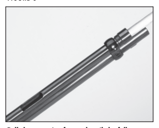
Pull the magazine forward until the follower clears the loading port.